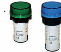
High Lens Pilot Light