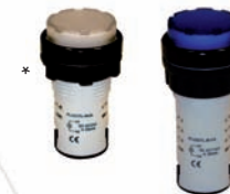
Teeth Lens Pilot Light