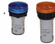
Pilot Light with Concentric Rings