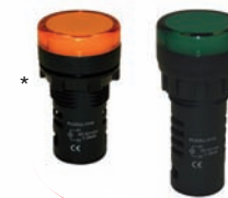
Low Lens Pilot Light