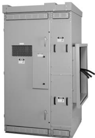
Outdoor Medium Voltage Switch—MVS Cable Connection to Liquid-Filled Transformer