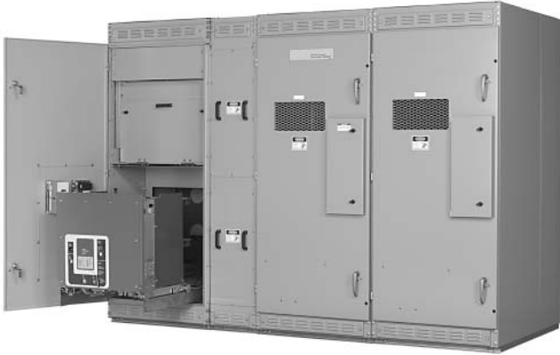
Indoor Metal-Enclosed Drawout Vacuum Breaker—MEB Used as Main for Two Fused Switches