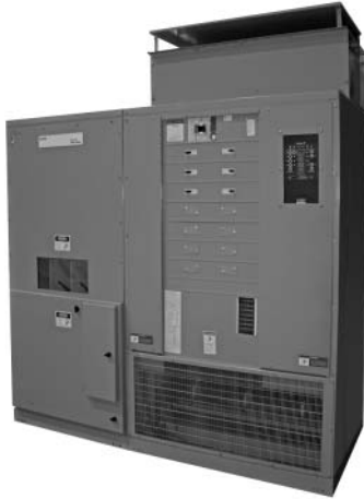
Bottom Cable Entry and Top Cable Entry