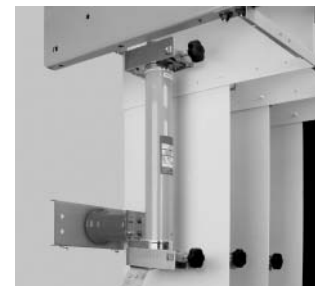
MVS-C Fuse Mounting

Fuse mountings: Complete three-phase fuse mounting assemblies or fuse live parts are available that are fully compatible with MVS-C switches. The fuse mountings are intended for use with Eaton's fuses.